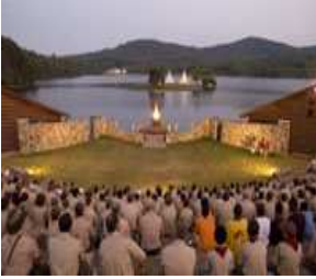
Campfire at Woodruff Scout Reservation.

If you make listening and observation your occupation you will gain much more than you can by talk.