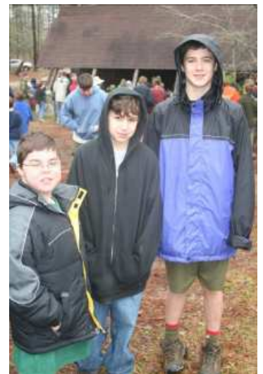
Friends Meet: Camporee allowed friends from other Troops to meet and greet.

Sunday morning activities were cut short due to the soggy conditions (both weather and scouts) but a quick ceremony was held to announce the winners of the Saturday events. Troop 477 won 1st place in the First Aid game and 3rd place in the Chip Find game. The Chip Find game was the main game for the theme of the week-